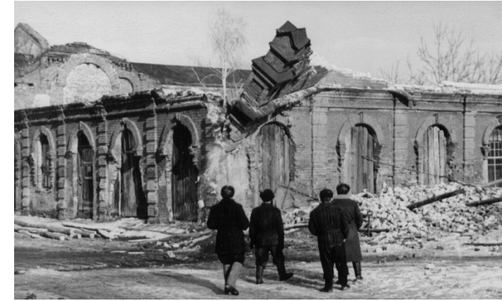
Burned city, 1947*

On March 1 and 2 of 1943 the city was completely destroyed in the punitive operation that was done by a punitive squad of Nazi regime consisted of the 105 light Hungarian division, German rear formations and members of the Ukrainian Auxiliary Police. Within two days 6 700 residents of the city - most of which were women and children - were killed. All of the building in the city with dead bodies of the residents were burnt to the ground. The reason of so cruelty was the activity of partisans in forests nearby.