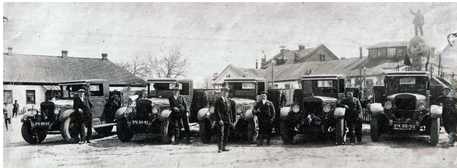
The first car fleet of the sugar refinery plant, 1935*

In the year of 1941 the Koriukivka city had strong economy based on sugar production. Besides sugar factory there were an oil factory, a brick factory, wood harvesting enterprises, agricultural enterprises, schools and kindergartens, a hospital.