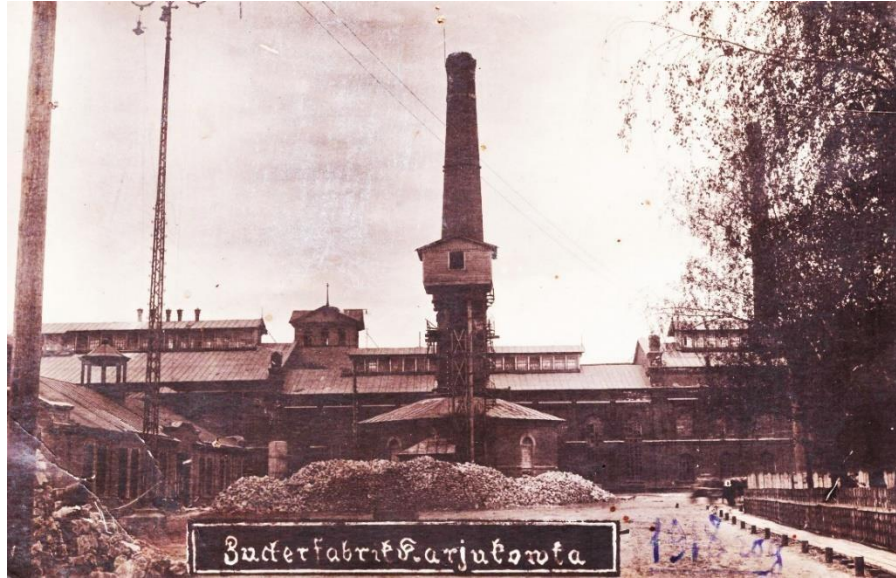
The sugar refinery plant, 1918*