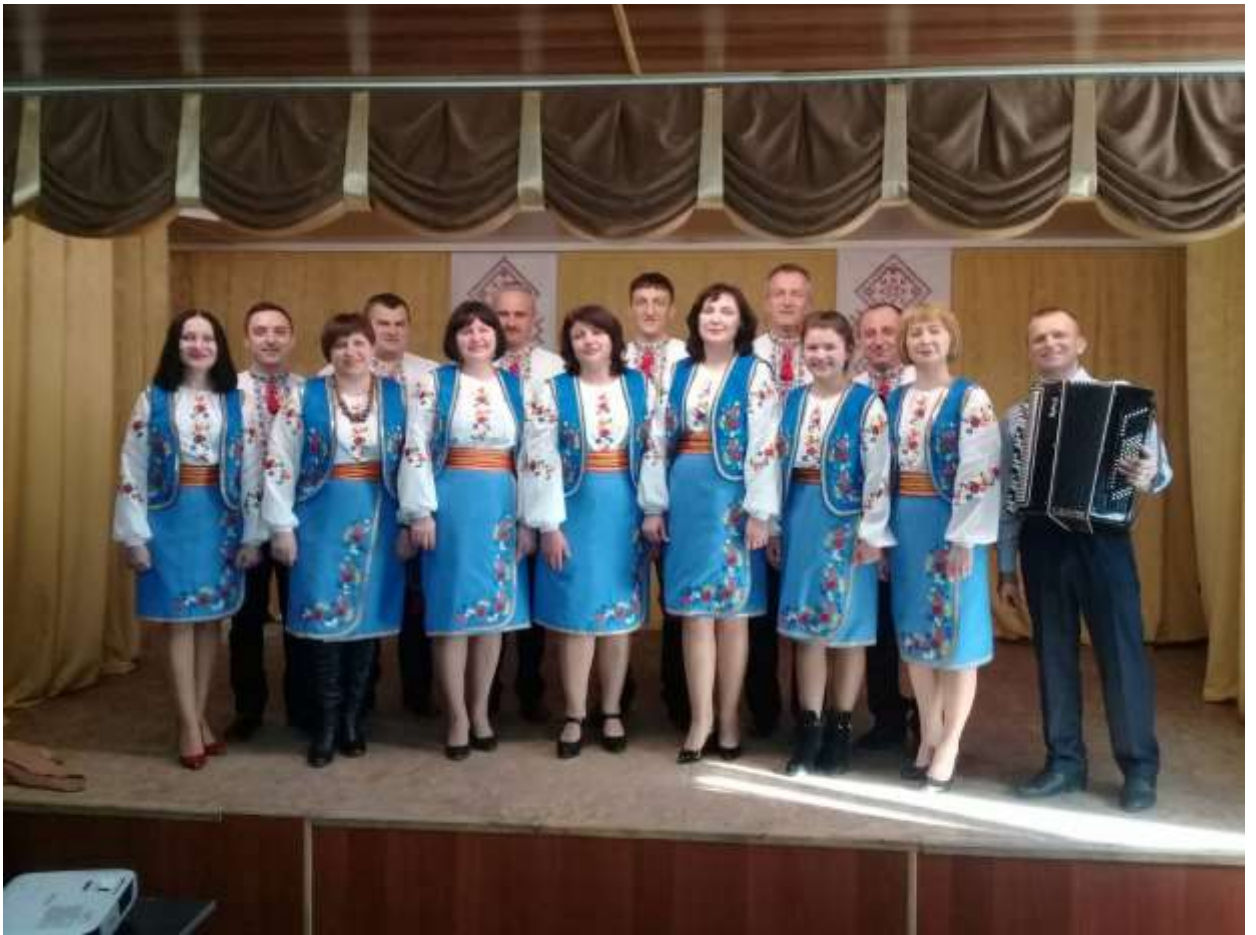
Amateur group "Vyshnevyy Tsvit" of the municipal institution "Center of Culture, Arts, Aesthetic Education and Sports"