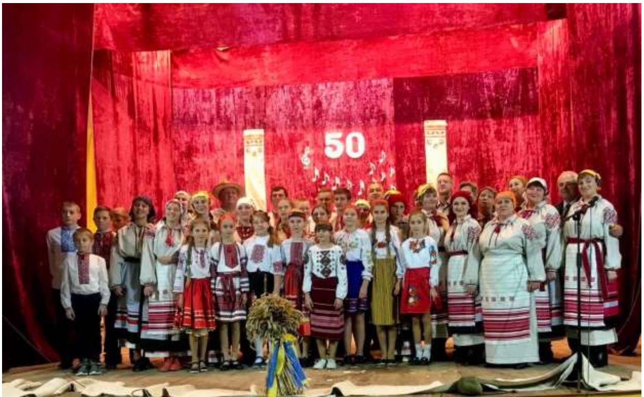
Amateur folk group "Pereveslo" (Radekhiv village House of Culture)