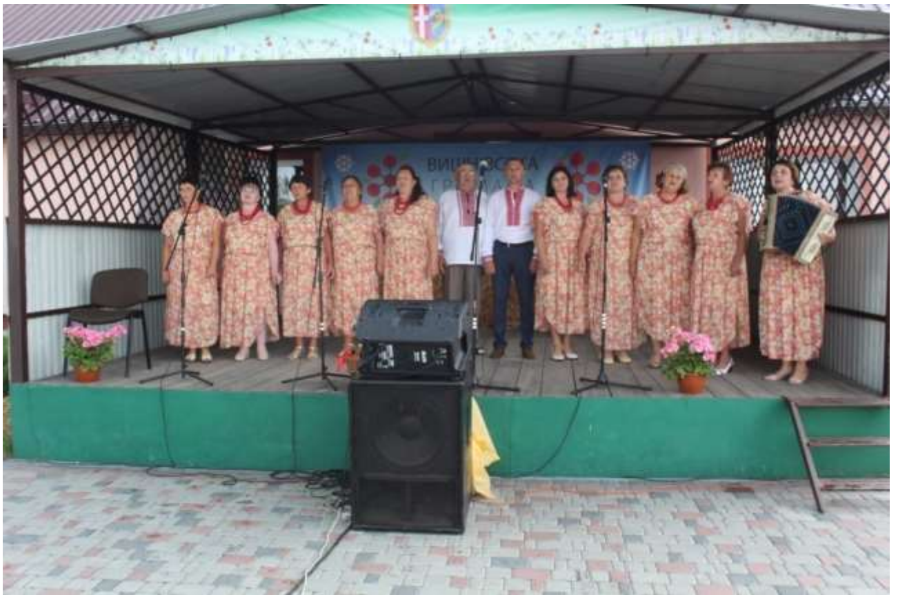
"Berehynia" (Rymachi village club)