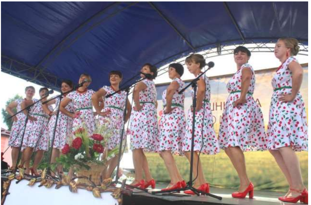
"Glamyrni molodychky" (Mashiv Village House of Culture)