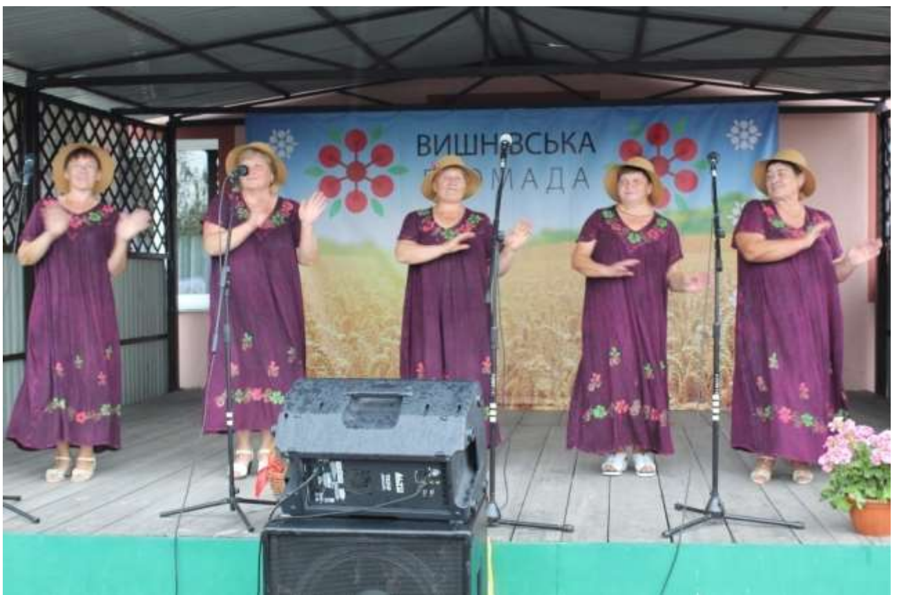
"Berezhanka" (Bereztsi village club)