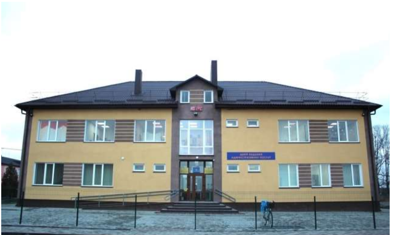
Administrative building of the village council