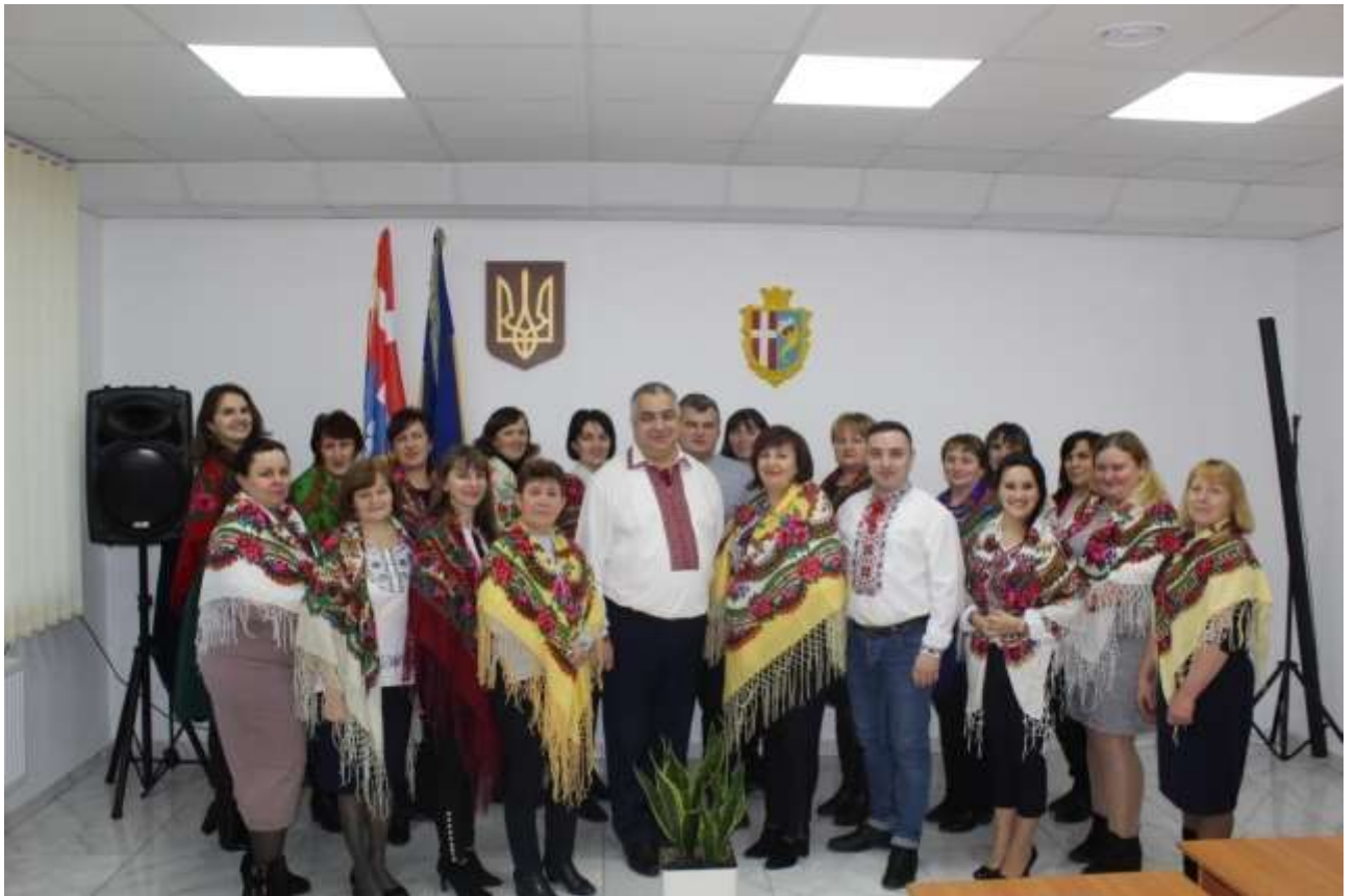
Executive board of Vyshniv village council